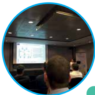
ZELDA Open Day, 21st June 2016 Brussels, Belgium