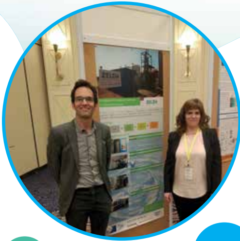
ZELDA at EUROMED 2017 'Desalination from Clean Water and Energy: Cooperation around the World' Tel Aviv, Israel