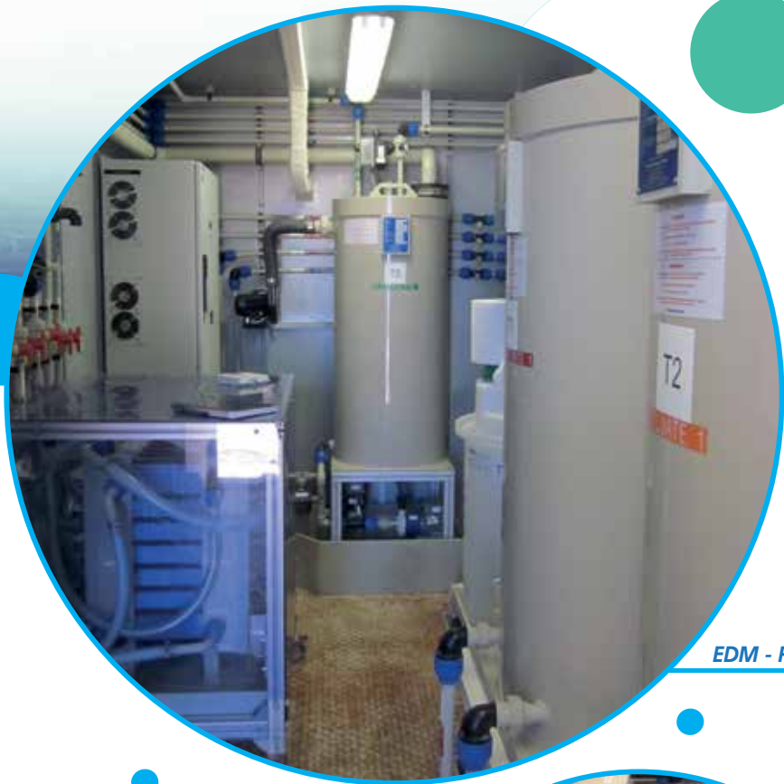
EDM - Pilot Plant