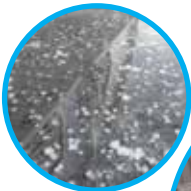
Salt recovered from evaporation ponds