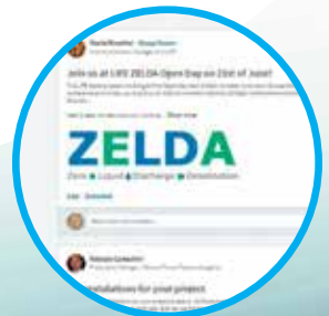
Presence in Social Media and Internet