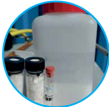
Valuable compounds recovered: Mg(OH) 2 and Na 2 SO 4